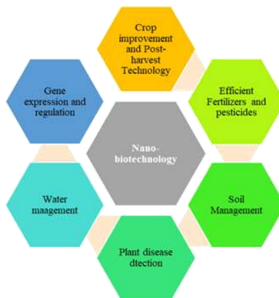
Fig 3: Roles of Nanobiotechnology in precision agriculture

Biotechnology plays a major role in the crop improvement and production in several ways (Figure3). Genetic engineering has evolved as a promising field to manage pest and diseases through gene cloning and gene modification of host plants. There are many information on transgenic plants against pathogenic microorganisms or any other pathogenic organisms such as phytonematodes etc. or insects as to express insecticidal genes such as Bt , trypsin suppressor, lectins, plantibodies, ribosome inactivating proteins, secondary plant metabolites, vegetative insecticidal proteins, etc. [50]. Besides, there is a gene transfer technique to transfer especially Bt Cry genes to microbes, such as fungi associated with disease-causing nematodes, which helps the nematodes to complete their life cycle [51].