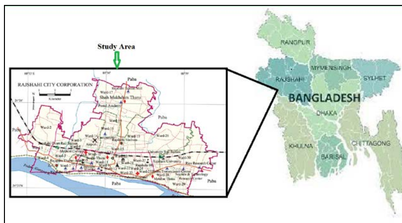
Fig 1: Location map of the study area (Rajshahi City)

Rajshahi City is located in between 24°20' and 24°24' north latitudes and in between 88°32' and 88°40' east longitudes and the total area is 95.56 sq km. It is bounded by Paba upazila on all sides (Figure 1).