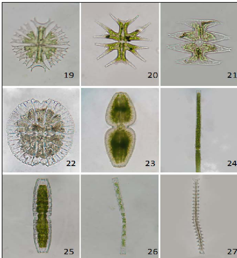
Plate 3: 19. Micrasteria sfurcata 20. Micrasterias mahabuleshwariensis var. mahabuleshwariensis 21. Micrasterias pinnatifida 22. Micrasterias thomasiana 23. Pleurotaenium ovatum 24. Pleurotaenium trabecula var. rectum 25. Pleurotaenium verrucosum 26. Gonatozygon aculeatum 27. Triploceras gracile